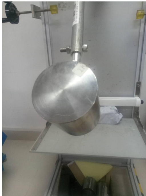
Figure 2 Test photo