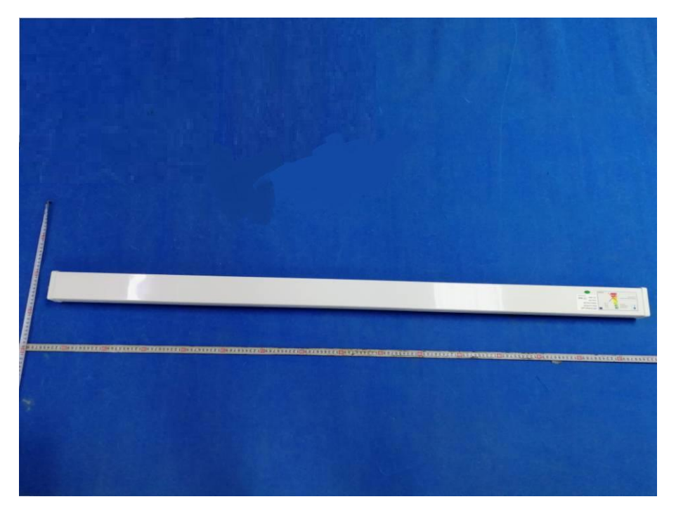
Fig. 2 Photo of Sample -----END OF REPORT-----