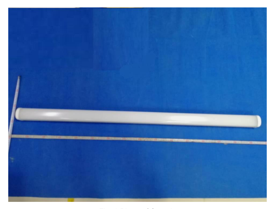
Fig. 1 Photo of Sample